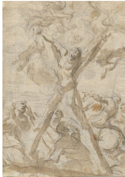
ill. 6: Guillaume Courtois The Crucifixion of Saint Andrew Grey wash on black chalk Düsseldorf, Kunstmuseum