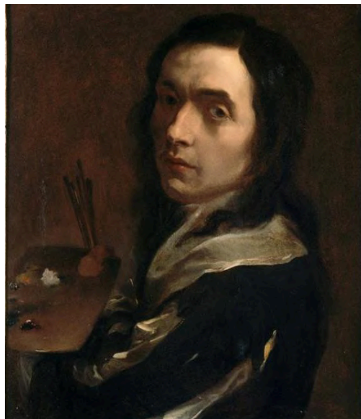
ill. 3: Guillaume Courtois

Like his older brother, the battle painter Jacques Courtois (1621-1671), Guillaume was born in Saint-Hippolyte, a town then belonging to the county of Burgundy. He spent his entire career in Rome, where he moved with his family as a child, fleeing the plague and the Ten Years' War.