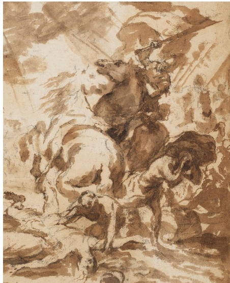
ill. 1: detail

Guillaume Courtois draws the scene at its climax: dazzled by the divine light, Paul, unconscious, has just fallen from his still rearing horse. While one of his comrades tries to come to his aid, the other legionnaires are shaking in confusion, frightened by the miracle. The liveliness of the brushwork combined with the strong chiaroscuro rendered by a high-contrast wash accentuates the dramatism of the whole. The witnesses to the miracle are treated as a seething mass at the foot of which lies the figure of the saint, bathed in a halo of light (ill. 1).