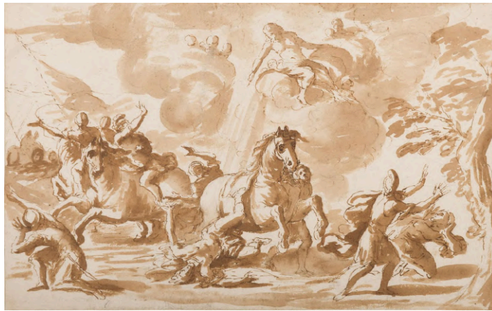
ill. 5: Guillaume Courtois The Conversion of Saint Paul Pen and brown ink wash Private collection

The same subject was treated by Guillaume Courtois in another sheet (ill. 5). Although the composition and treatment differ (our drawing has no pen-and-ink, for a more vivid rendering), the figures on the two sheets are very similar.