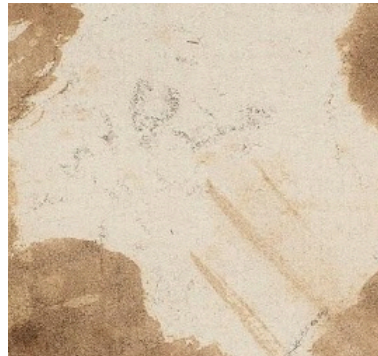
ill. 2: detail