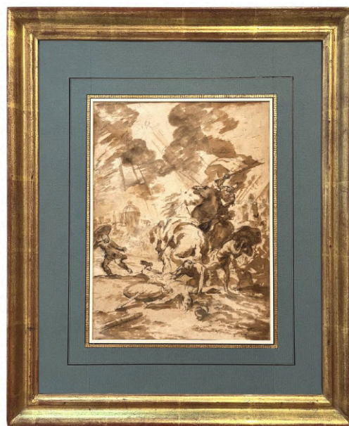
ill. 7: Our drawing framed

Our sheet is in very good condition. We had it mounted in the manner of Mariette and framed in a patinated gilt frame.