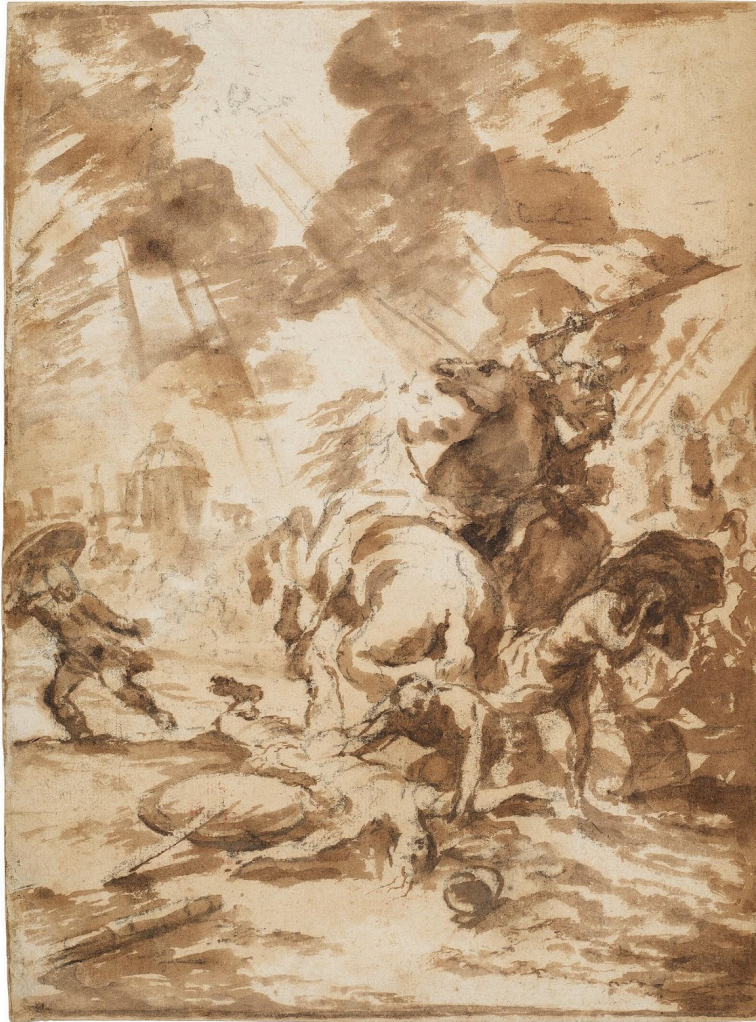
Guillaume COURTOIS, called IL BORGOGNONE (Saint-Hippolyte, 1628 - Rome, 1679)